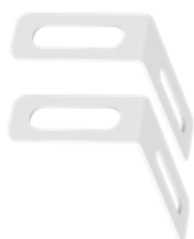
Model: RW-F10.6-Fixed support

Details: Pair of 2/0AWG DC power cable (two end with M10 copper terminals) and RJ45 communication cable connect with hybrid inverter. The default length is 1500mm.